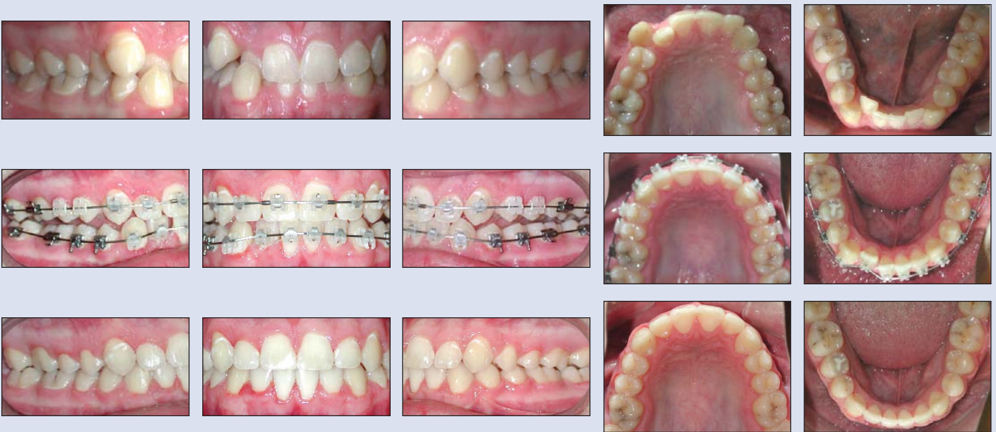
NON-EXTRACTION CASE WITH A TREATMENT TIME OF 13 MONTHS